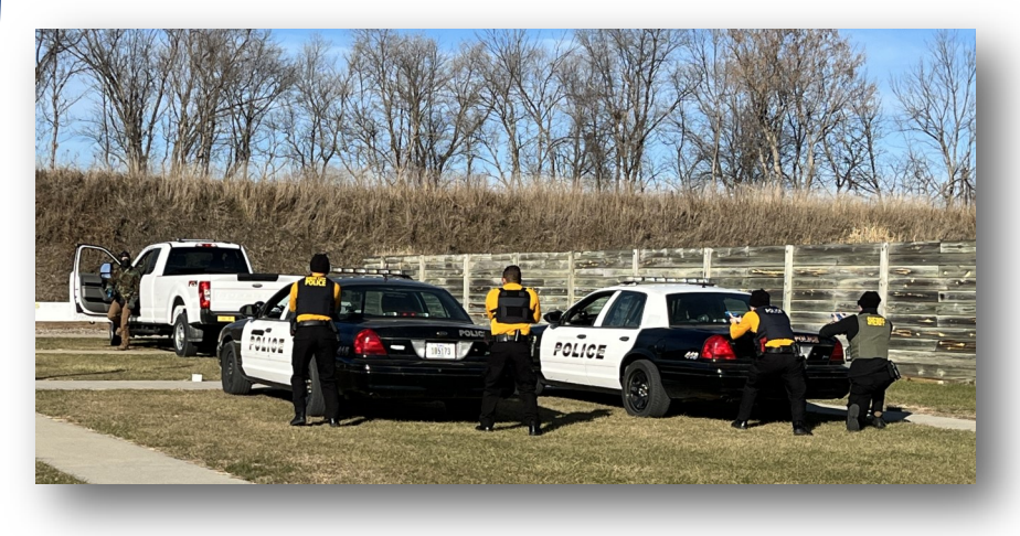
Above and right: OWI and high risk stop scenarios.